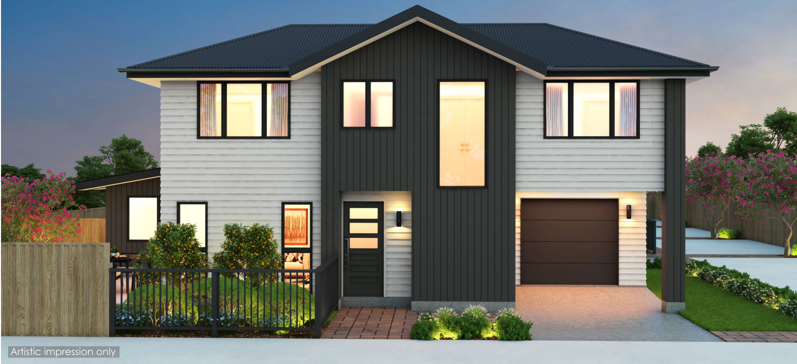
Artistic impression only